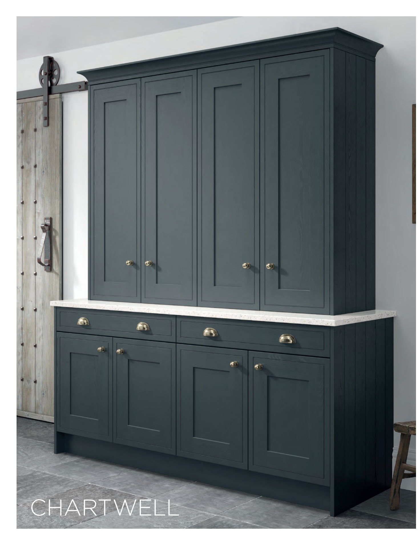
OPPOSITE CHARTWELL IN PAINTED CHARCOAL WITH CUP HANDLE (K185) AND KNOB (K186)