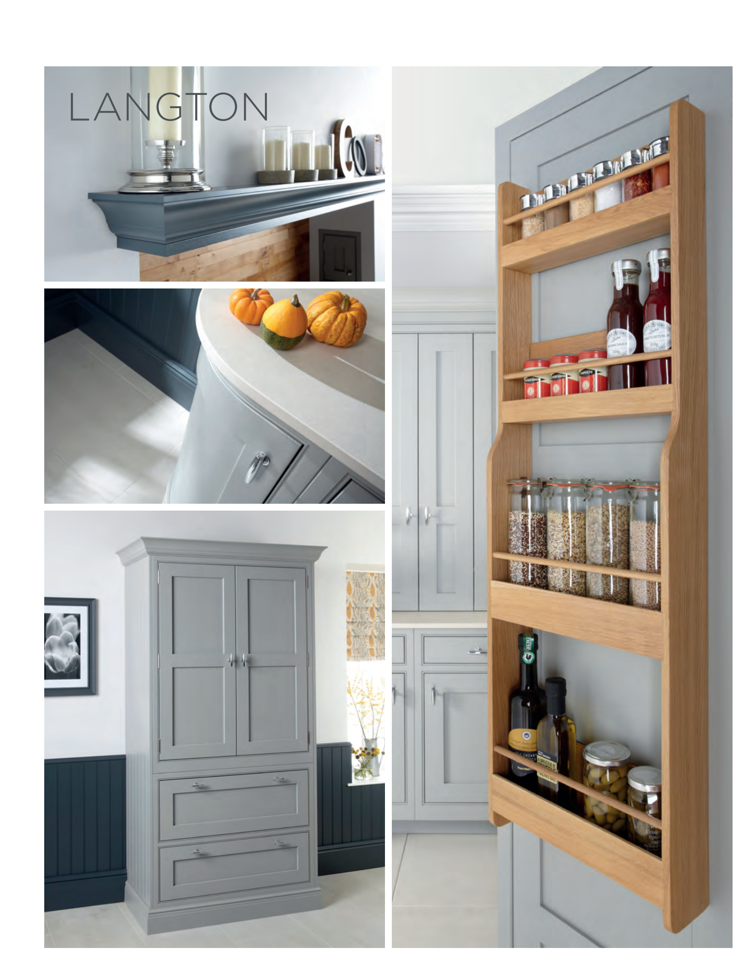
ABOVE LANGTON IN PAINTED GRAVEL AND SEAL GREY WITH KNOB (K149), T-BAR (K166) AND HINGE (H5)