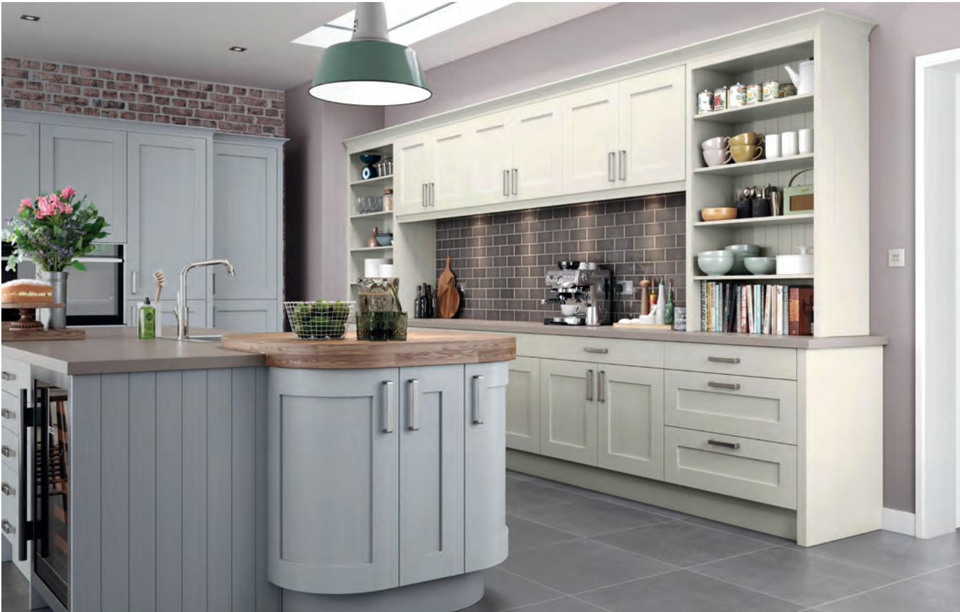
ABOVE BARNES IN PAINTED LEAD AND PUTTY WITH HANDLE (K163)