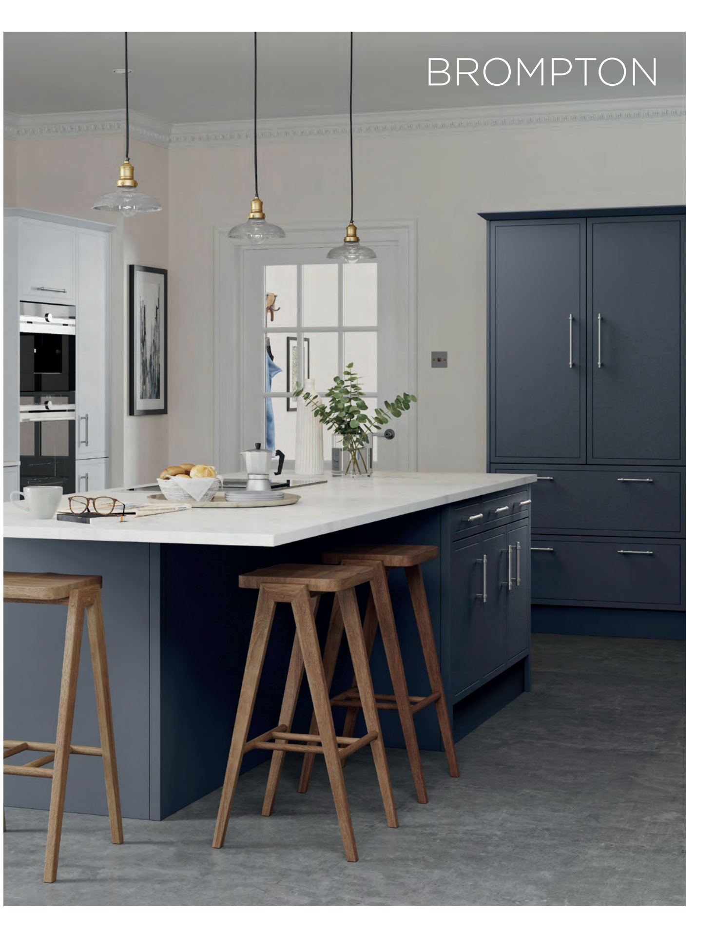
ABOVE BROMPTON IN FROST GREY AND INDIGO BLUE WITH HANDLES K207 AND K208