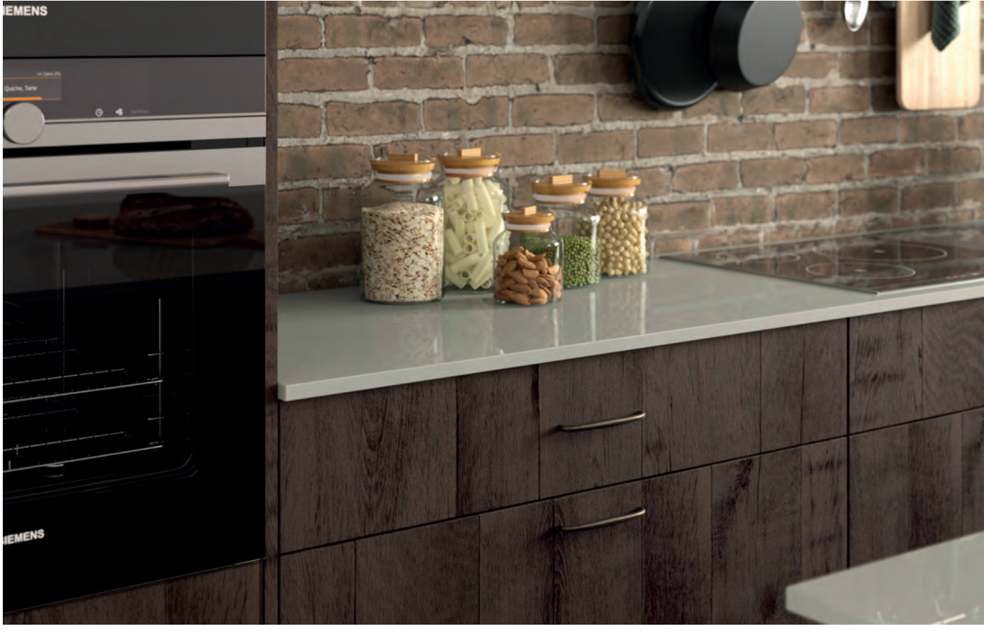
ABOVE TOP OTTO IN DARK WALNUT AND OXIDE WITH HANDLE-LESS RAIL IN ANTHRACITE ABOVE BOTTOM OTTO IN DARK OAK WITH SMALL BOWED HANDLE (K221)