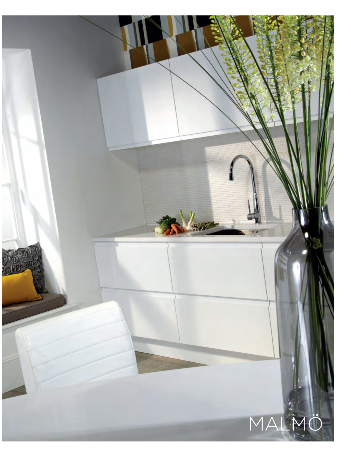
OPPOSITE MALMÖ IN MATT WHITE