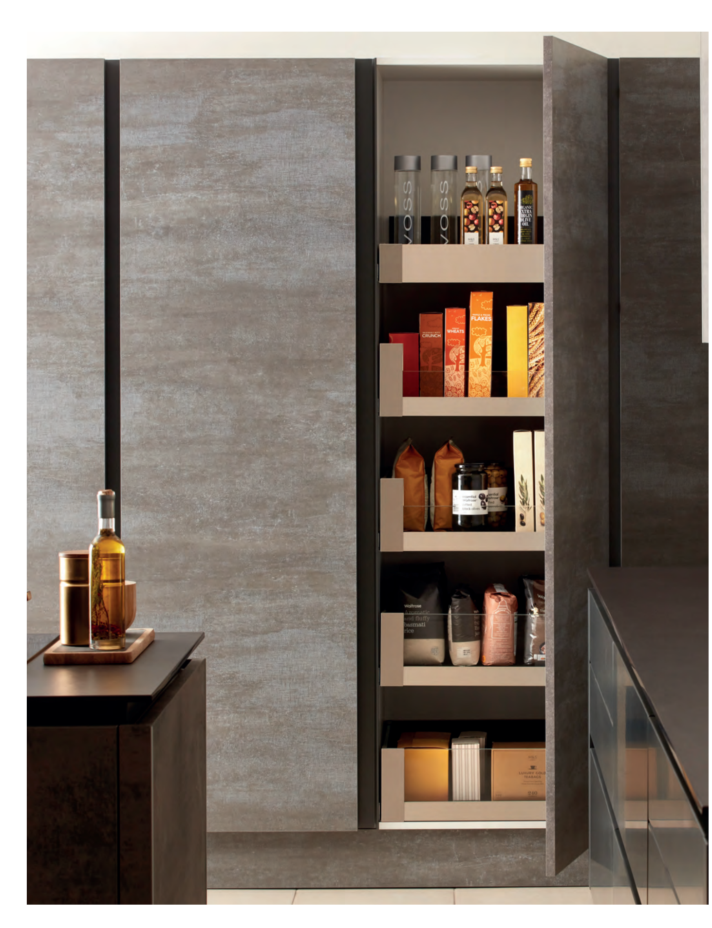
ABOVE OTTO IN DARK TEXTURED CONCRETE AND OXIDE WITH HANDLE-LESS RAIL IN ANTHRACITE