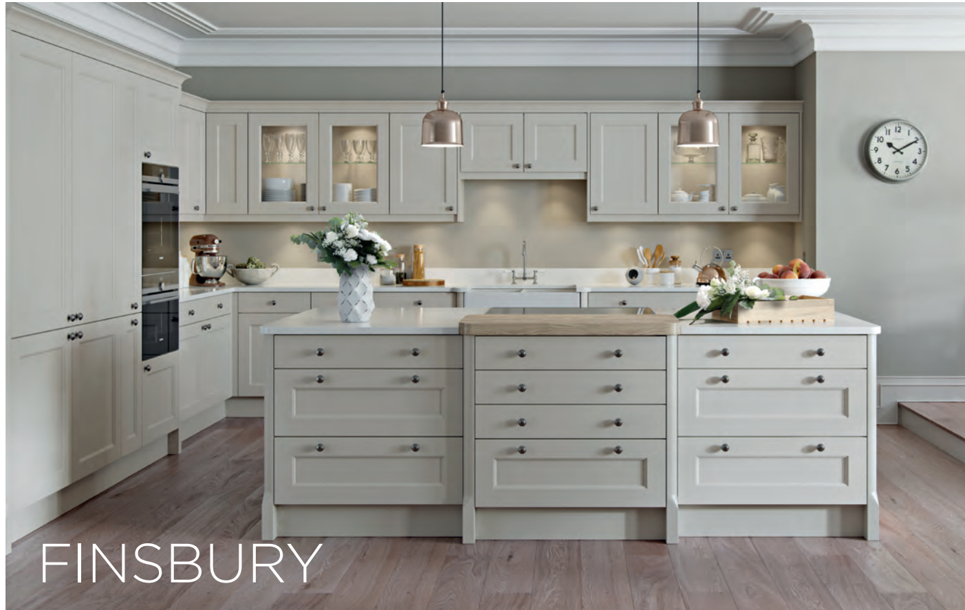
ABOVE FINSBURY IN PAINTED PUTTY WITH KNOB (K144)