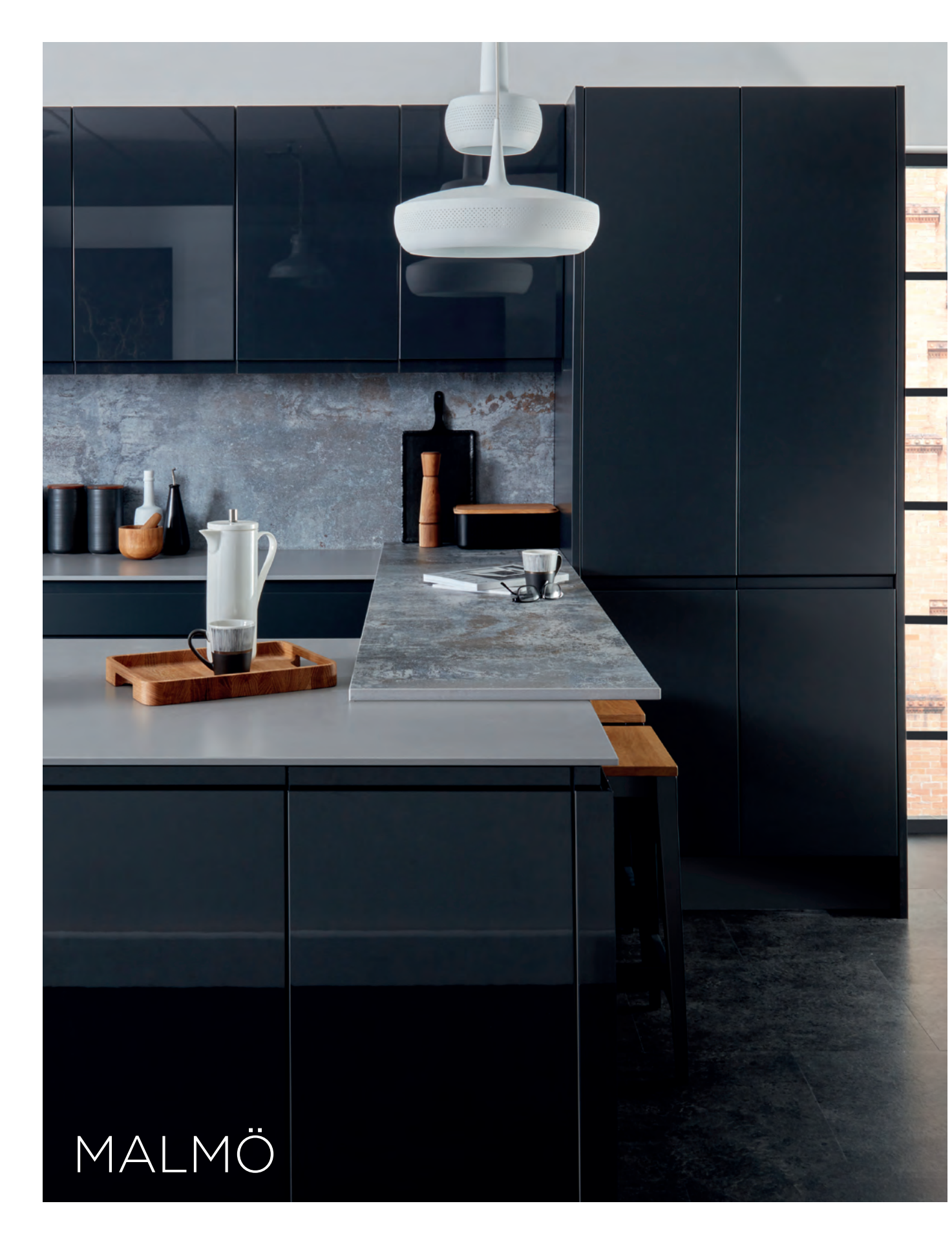
ABOVE MALMÖ IN GLOSS AND MATT ANTHRACITE