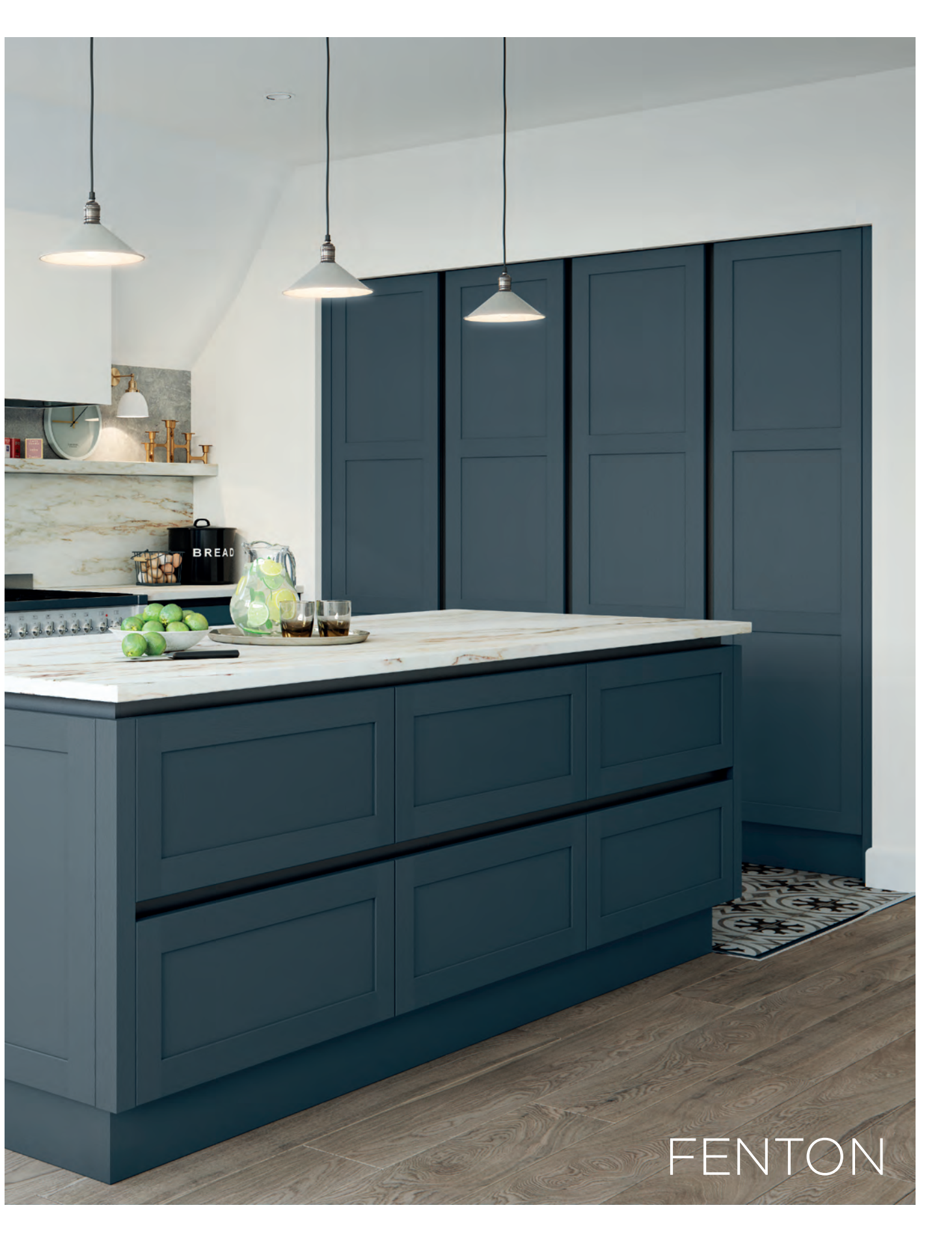
ABOVE FENTON IN PAINTED PRUSSIAN BLUE WITH HANDLE-LESS RAIL SYSTEM IN ANTHRACITE