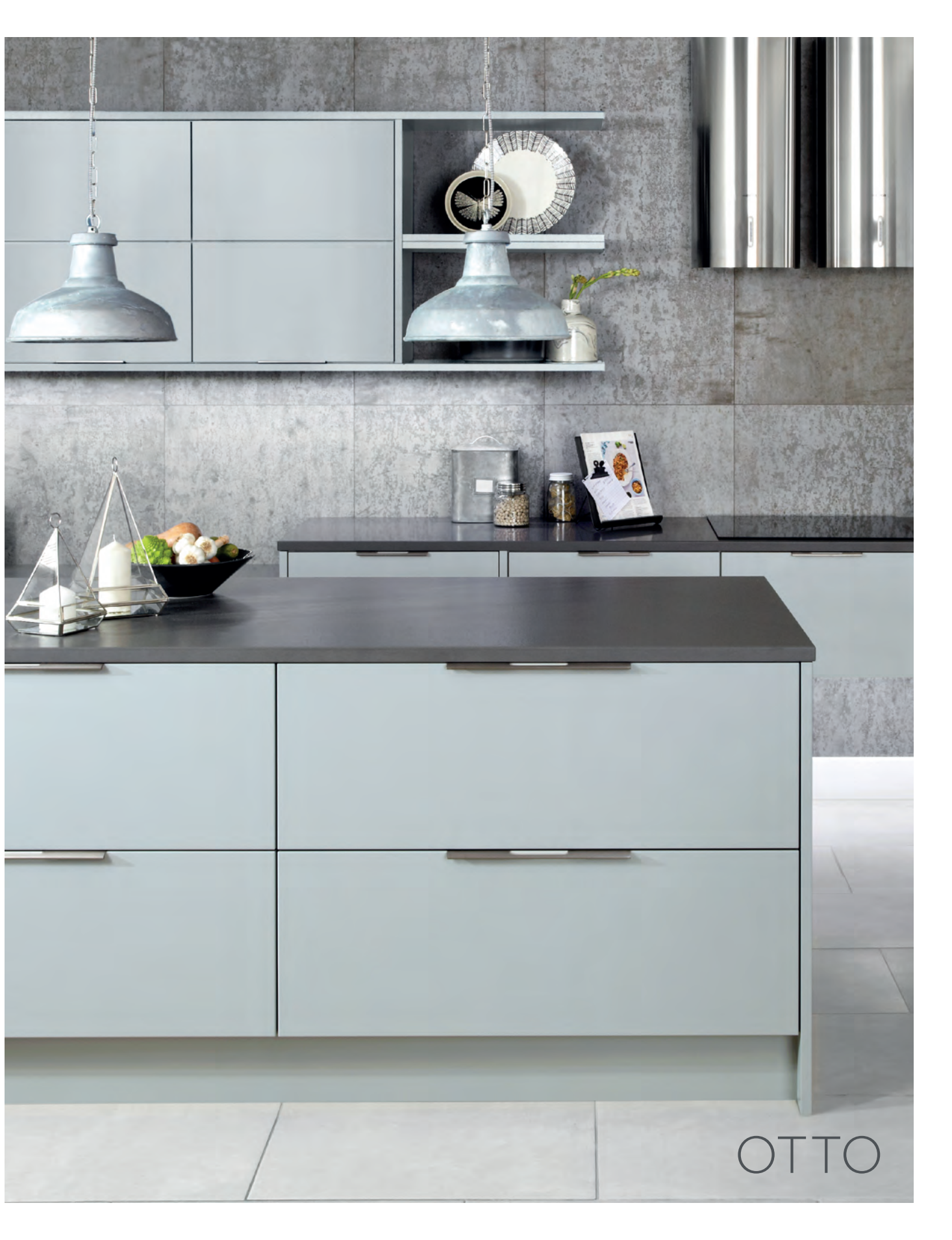
OPPOSITE OTTO IN MATT LIGHT GREY WITH TOP FITTING HANDLE (K158)