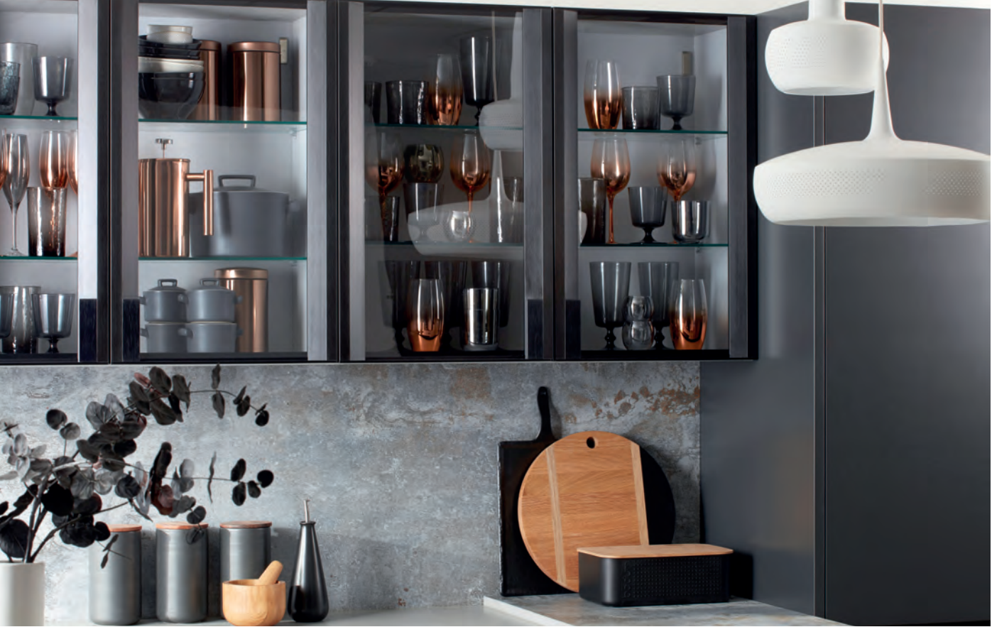
ABOVE MALMÖ IN GLOSS AND MATT ANTHRACITE WITH BLACK ANODISED ALUMINIUM GLASS DOORS