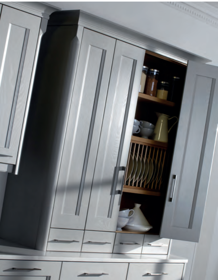
ABOVE KEW IN PAINTED SOFT GREY WITH HANDLE (K147)