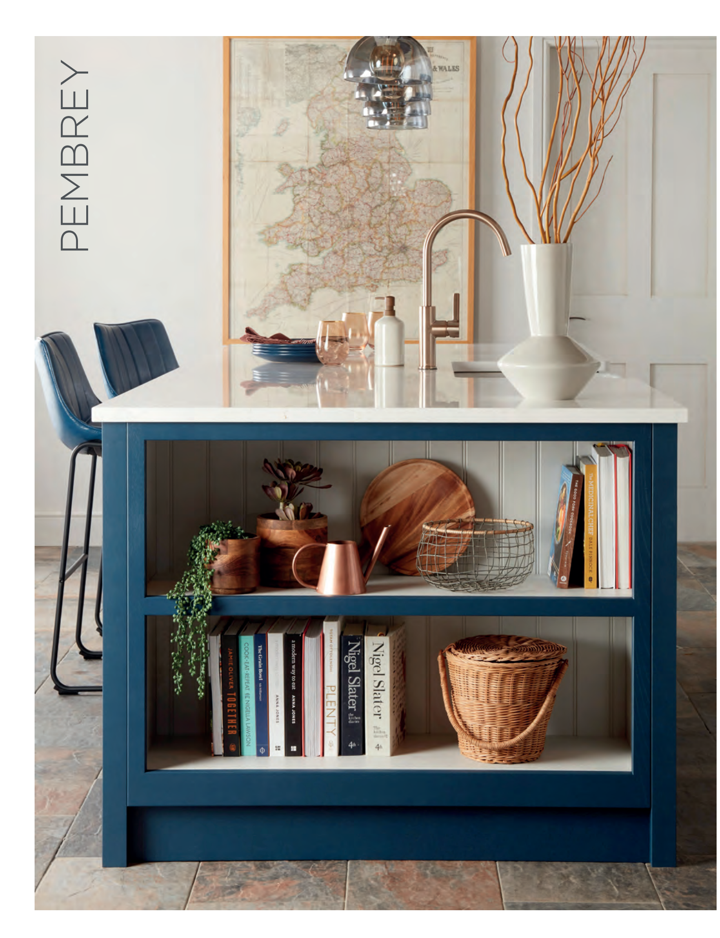
ABOVE PEMBREY IN PAINTED PALE SMOKE AND PRUSSIAN BLUE