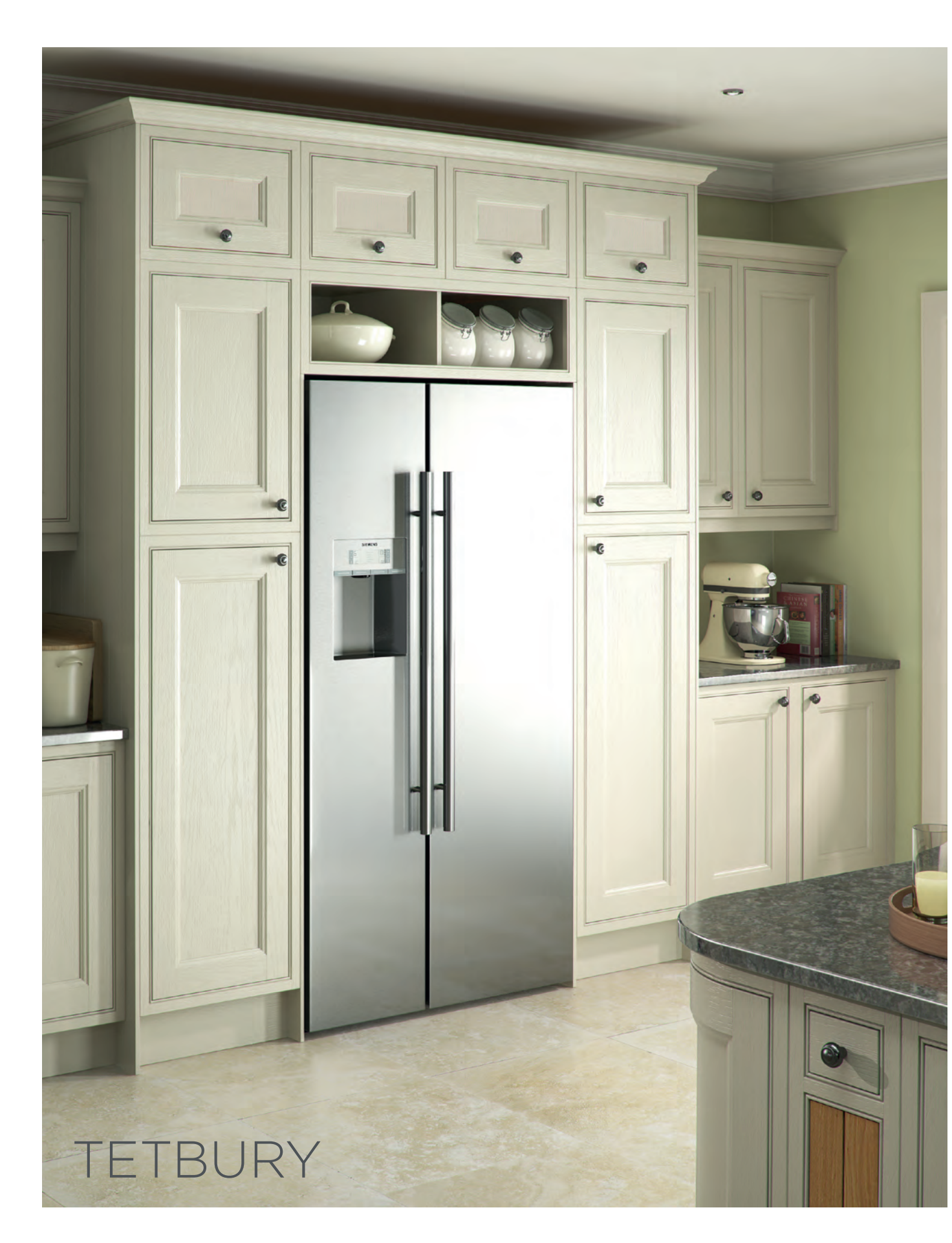
ABOVE TETBURY IN PAINTED CHALK WITH KNOB (K144)