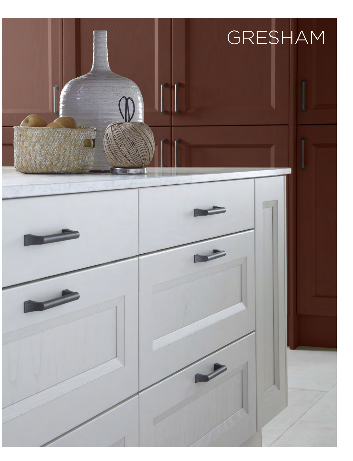
ABOVE GRESHAM IN PAINTED TUSCAN RED AND PUTTY WITH HANDLE (K171)